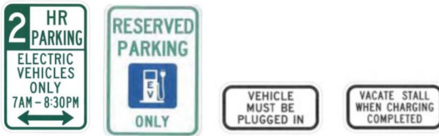
Figure 2: (Labeled Left to Right A-D) Example EVSE regulatory signs.

Regulatory signs should be no smaller than 12" x 18" and placed immediately adjacent to the EVSE at a height of 7 feet.