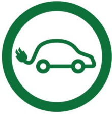
Figure 1: City of Boston's Wayfinding Logo for General Service EVSE Signage.